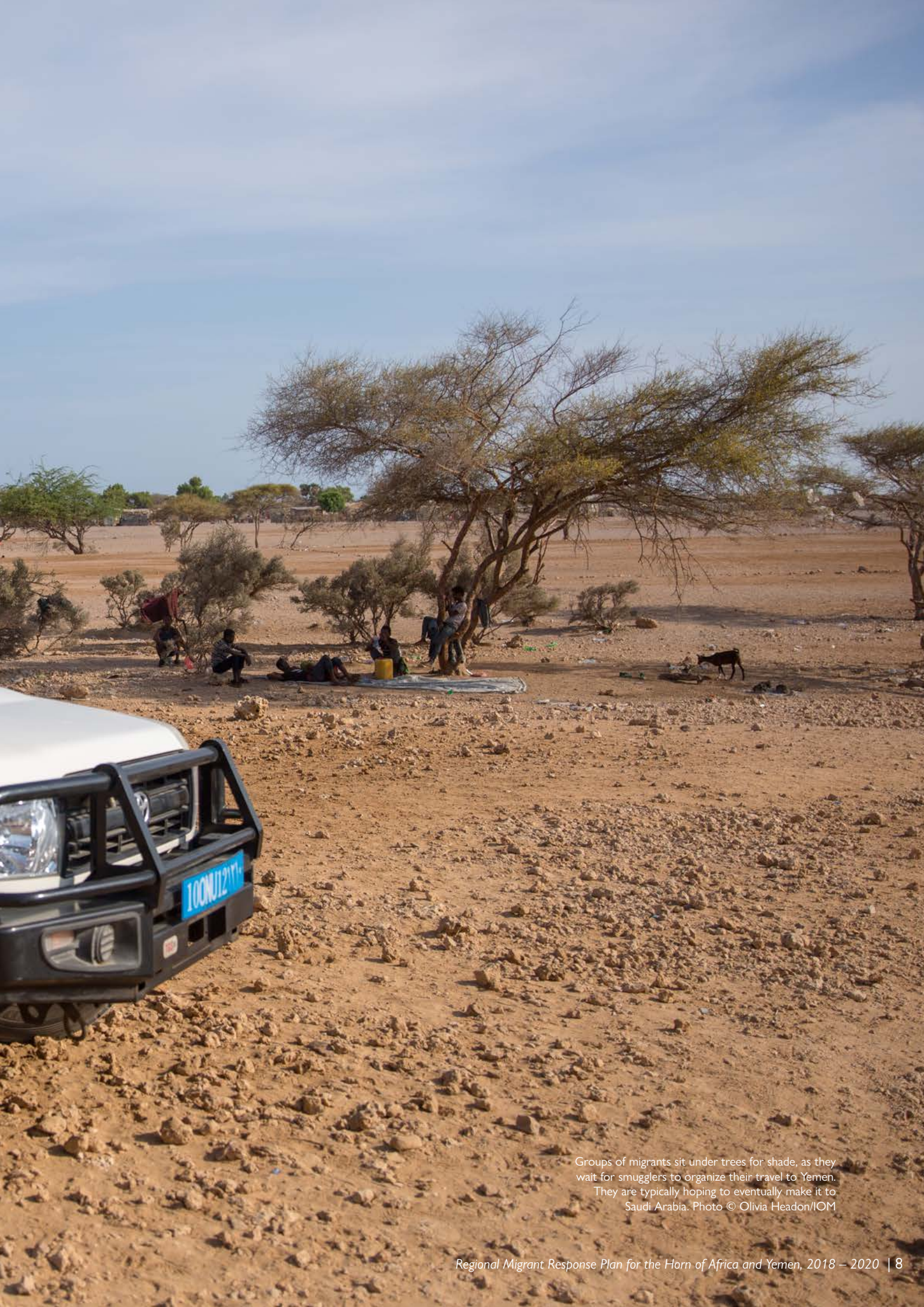
Groups of migrants sit under trees for shade, as they wait for smugglers to organize their travel to Yemen. They are typically hoping to eventually make it to Saudi Arabia.